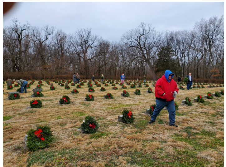
Above is a view looking Northeast in the cemetery of graves being decorated. It looked beautiful. Wreaths Across America is a Nationwide event that occurs in Veteran Cemeteries across the country, and it occurs at 11:00 am local time, simultaneously. Pretty cool, and thanks to the Missouri Division UDC for hosting this event in Higginsville, and for doing such a great job of it.